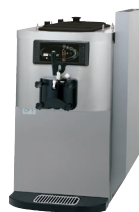
Optional Top Air Discharge Chute

Rockton, Illinois 61072 Toll Free: 1-877-HELP-MCD Phone 815-624-8333 Fax 815-624-8000 www.taylor-company.com e-mail: helpmcd@taylor-company.com