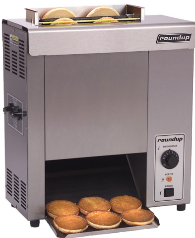
VCT-1000 with bun feeder

The Vertical Contact Toaster model VCT-1000 is designed for contact toasting of buns.