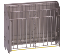
Bun Feeder BF-1 P/N 7000236