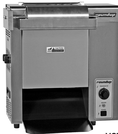
VCT-1000 with butter wheel